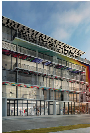
250 WYNWOOD | WYNWOOD 250 NW 24th St. # of Units: 11