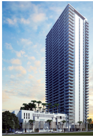
BAY HOUSE EAST EDGEWATER 600 NE 27th Street # of Units: 165