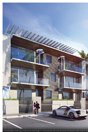
ELEVEN IN THE ROADS BRICKELL 529 SW 11th # of Units: 24