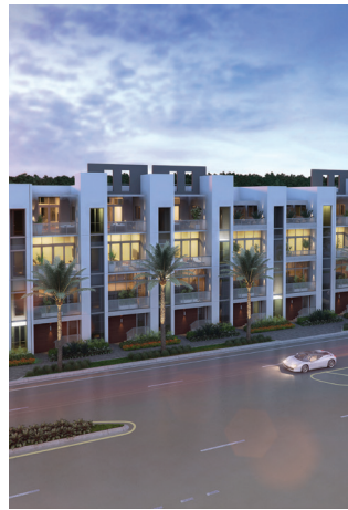
10 HARBOR HOLLYWOOD 2800 N. Ocean Drive # of Units: 10