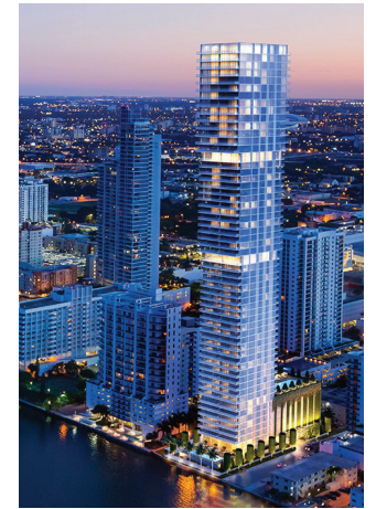
ELYSEE MIAMI EAST EDGEWATER 700 NE 23rd Street # of Units: 100