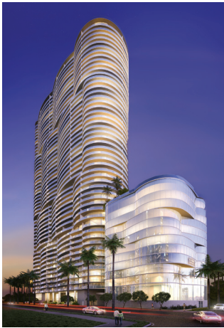
ARIA ON THE BAY Arts & Entertainment District 1770 N. Bayshore Drive # of Units: 647