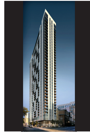
CENTRO DOWNTOWN MIAMI 151 SE 1st Street # of Units: 352