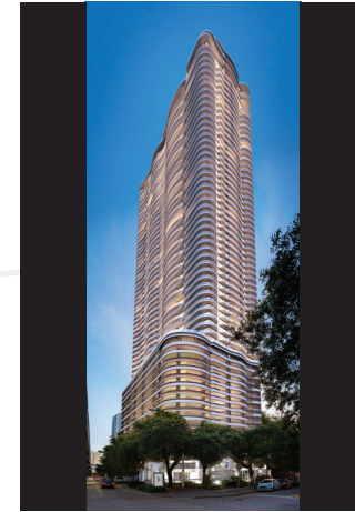
BRICKELL FLATIRON BRICKELL 1001 South Miami Avenue # of Units: 548