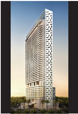
BRICKELL HOUSE BRICKELL 1300 Bay Drive # of Units: 374