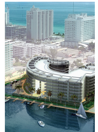
PELORO MIAMI BEACH MIAMI BEACH 6620, 6630 Indian Creek Drive # of Units: 114