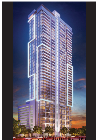
THE BOND ON BRICKELL BRICKELL 1080 Brickell Avenue # of Units: 328