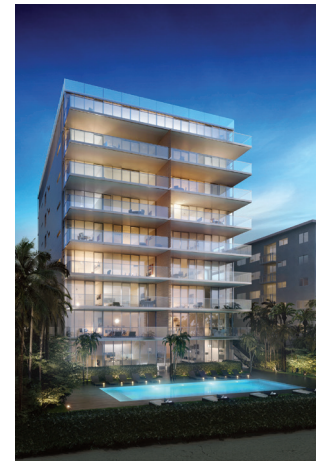
321 OCEAN | SOUTH OF FIFTH 321 Ocean Drive # of Units: 21 including 2 PH and 2 two-story villas