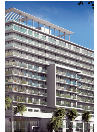
LE PARC AT BRICKELL BRICKELL 1600 SW 1st Avenue # of Units: 128