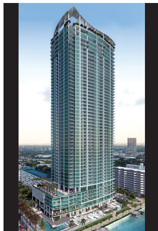
BISCAYNE BEACH EAST EDGEWATER 711 NE 29th Street # of Units: 399