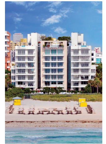
OCEAN HOUSE SOUTH OF FIFTH 125 Ocean Drive # of Units: 28