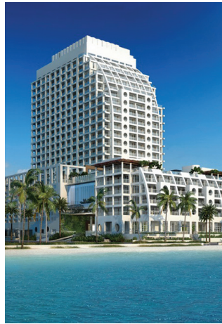
THE OCEAN RESORT RESIDENCES Fort Lauderdale Beach 551 N. Fort Lauderdale Beach Blvd. # of Units: 290